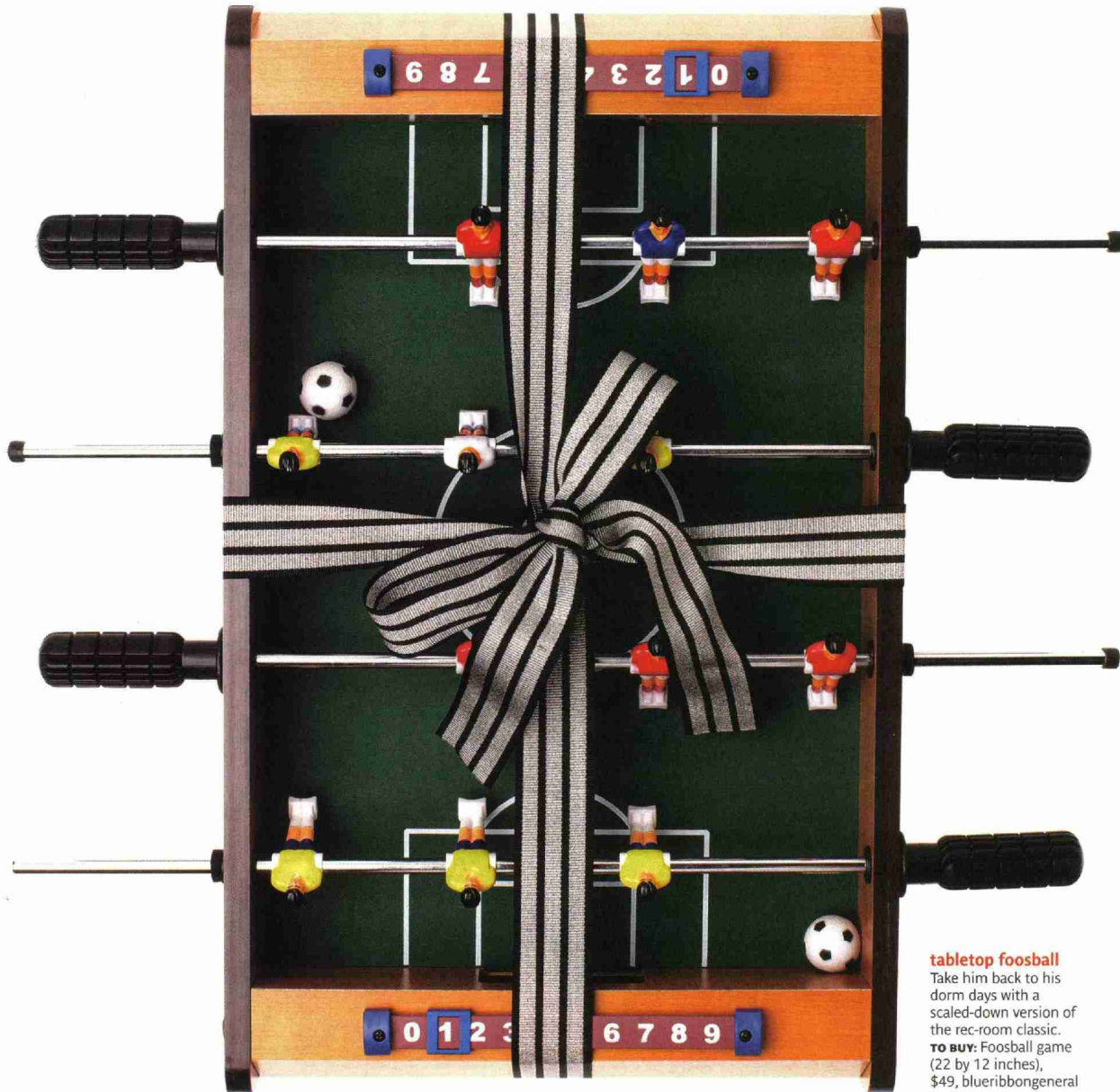
tabletop foosball Take him back to his dorm days with a scaled-down version of the rec-room classic. TO BUY: Foosball game (22 by 12 inches), $49, blueribbongeneralstore.com .